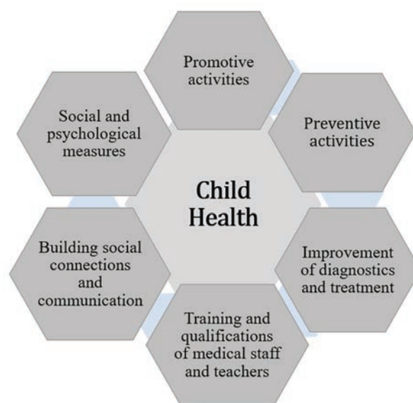
Fig. 1. Policy 7 of the National Health Strategy 2014-2020 of the Republic of Bulgaria

Fig. 1 indicates the primary activities related to effective functioning of child and school healthcare in line with Policy 7 of the National Health Strategy. Promotion introduces an active approach towards health and changes the individual's attitude to it (personalised approach and social responsibili-