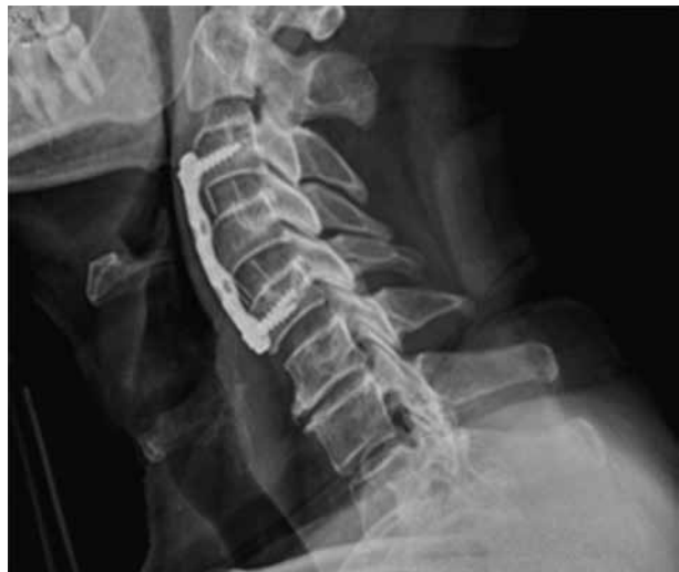
Fig. 3. One year post OP – ACDF and plating, adjacent level degeneration

In all of the 37 patients anterior surgery and fusion with cage and plate were performed (Fig. 3).