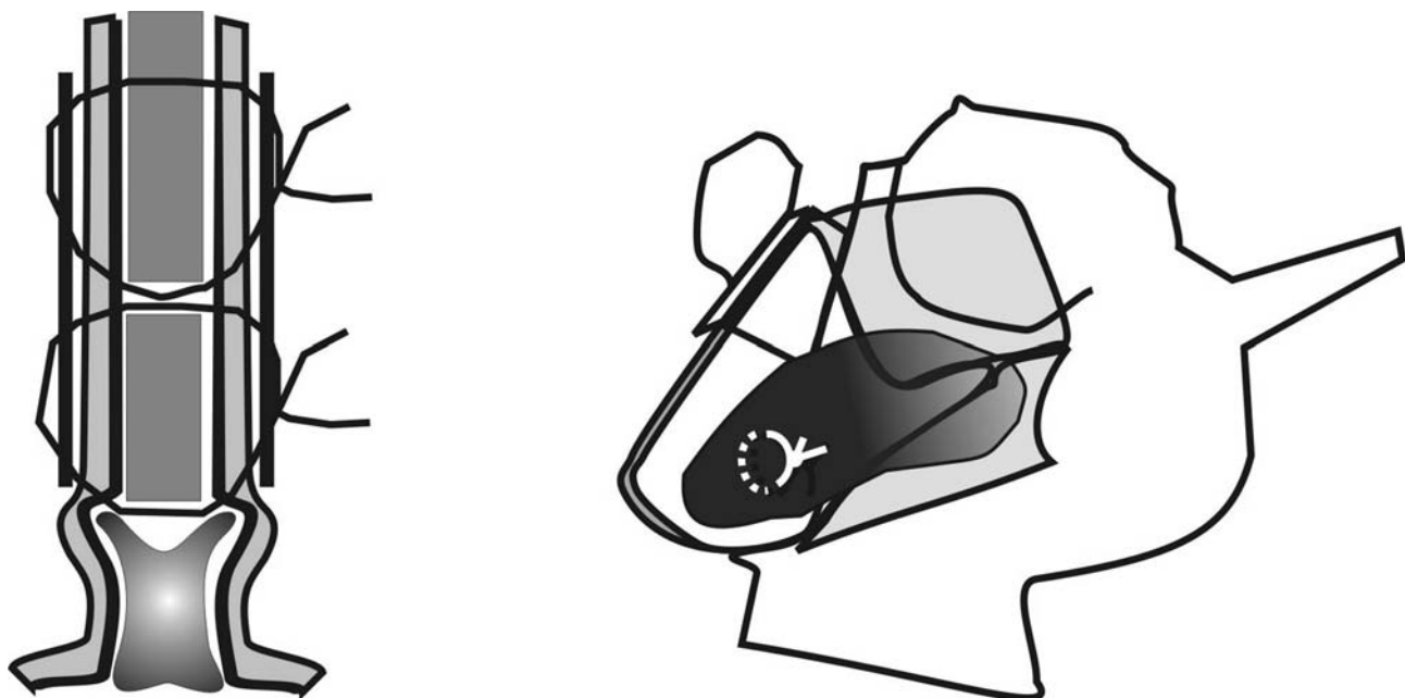
Fig.2. Splints fixing